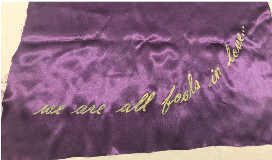
Light weight purple fabric