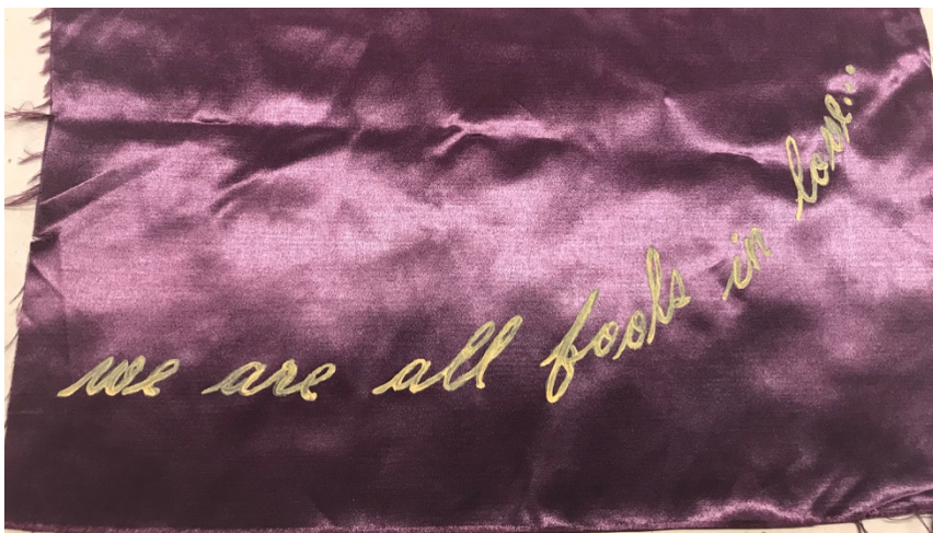
Medium weight purple fabric